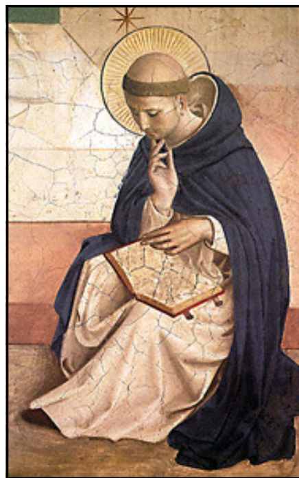
Saint Dominic 1170 - 1221

"Christ", the Pope went on, "is the most precious treasure that men and women of all times and places have the right to know and love! It is consoling to see how also in today's Church there are many people (pastors and lay faithful, members of ancient religious orders and of new